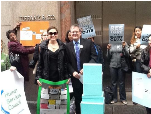
HSC at Austerity Breakfast at Tiffany's

At HSC, we're working hard to turn things around. We're raising awareness about the cuts' devastating effects on social services. We had a successful Austerity Breakfast at Tiffany's , which drew public attention to the tradeoff between extending the personal income tax (PIT) surcharge on high-income New Yorkers or cutting programs that serve the needy. Please see our blog and our Advocacy Results section for more information and press coverage received due to this event - but note that the numbers are staggering. Consider that a $20,000 necklace could be exchanged for 3,800 senior lunches, a $7,000 watch for 3,500 emergency meals to the homeless, and a $25,000 bracelet for 2,000 family food packages at food pantries.