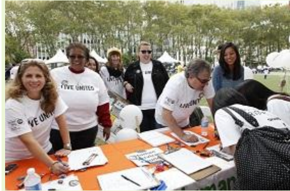
HSC at the Live United Bridge Walk Volunteer Festival

On September 15, a workgroup was convened on the Human Services Data Project ( HSDData ), an initiative to help providers track performance and